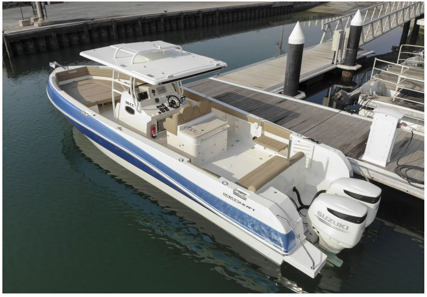
Silver Craft 36CC