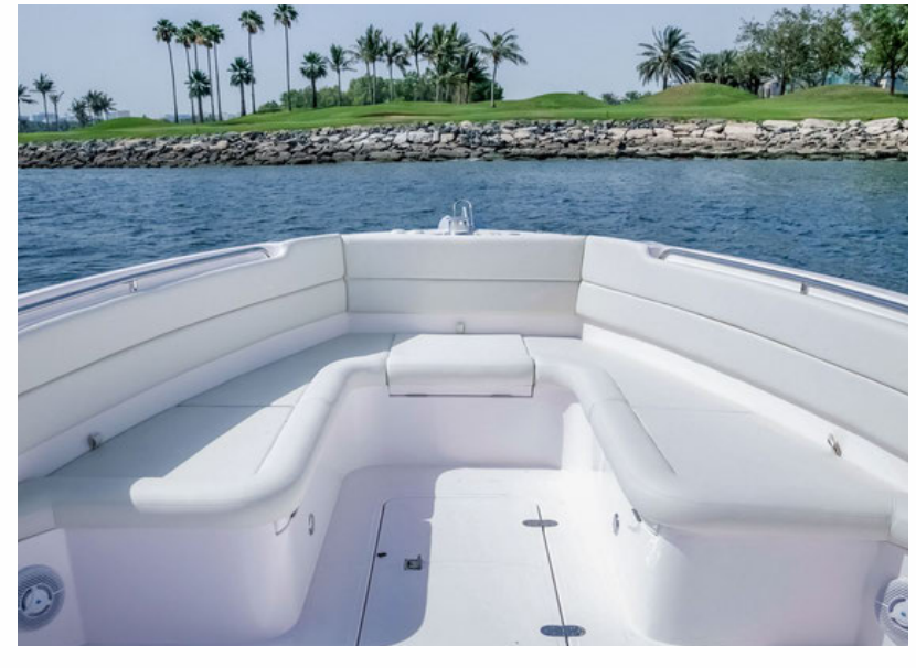
Silver Craft 36CC