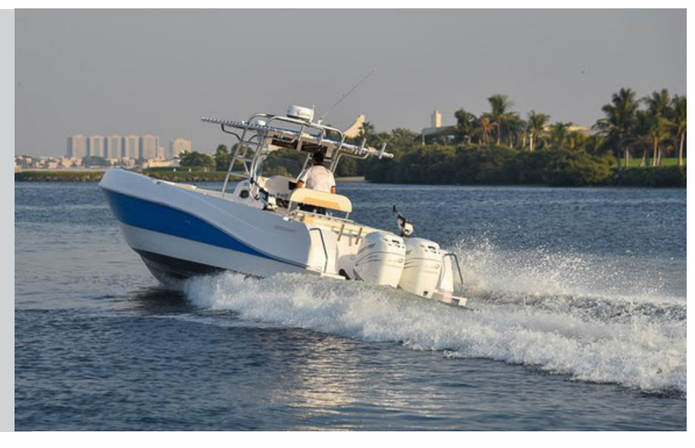
Silver Craft 36CC